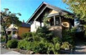
Subject Property – 1568 Bittle St.