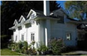
1532 Bittle St.