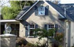
1560 Bittle St.