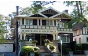
1568 Old Ocean Ave.

Submitting photos of homes which are similar in: